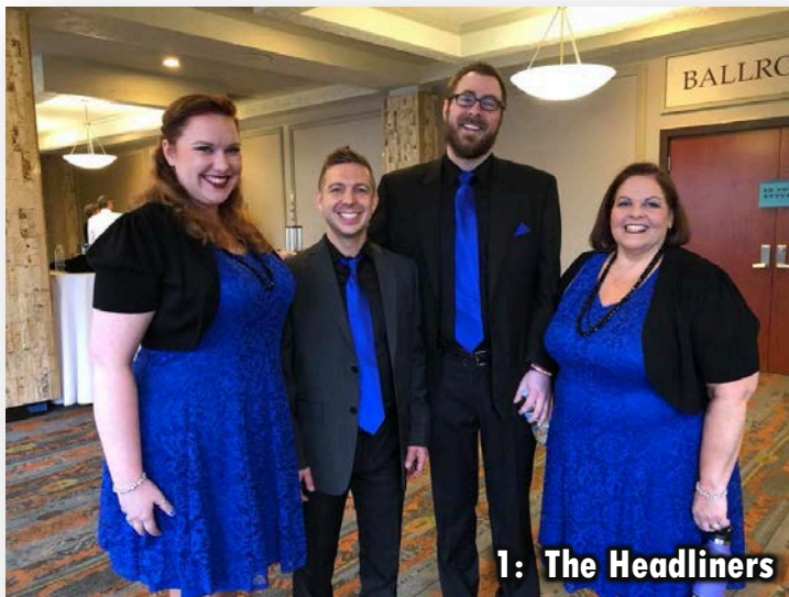
1: The Headliners