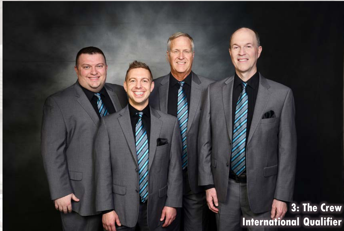
3: The Crew International Qualifier