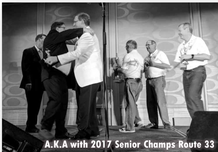
A.K.A with 2017 Senior Champs Route 33