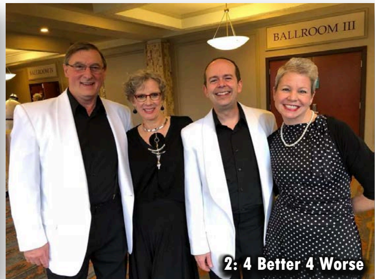
2: 4 Better 4 Worse