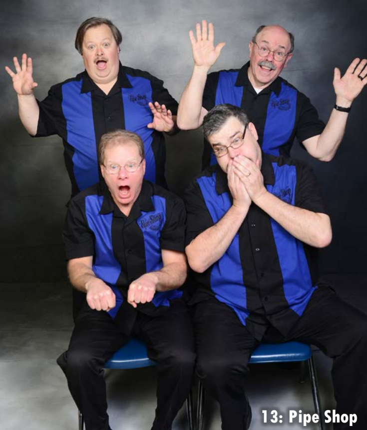
13: Pipe Shop