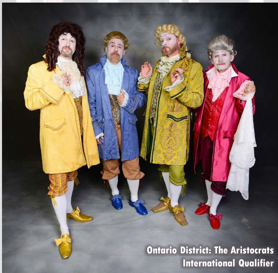
Ontario District: The Aristocrats International Qualifier