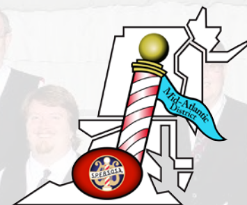
Mid-Atlantic District: Up All Night International Qualifier