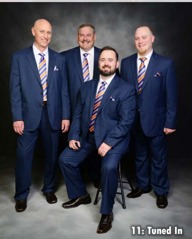
11: Tuned In