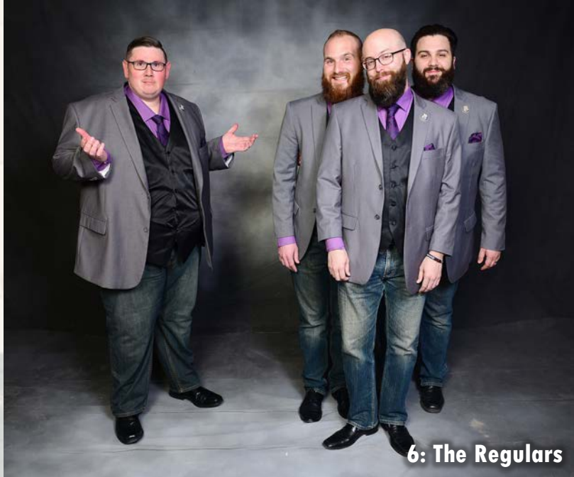
6: The Regulars