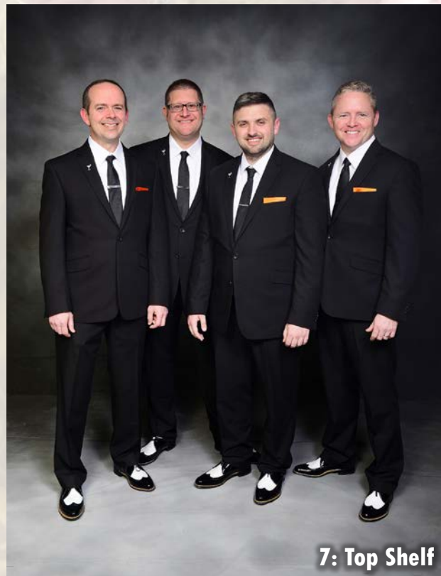
7: Top Shelf