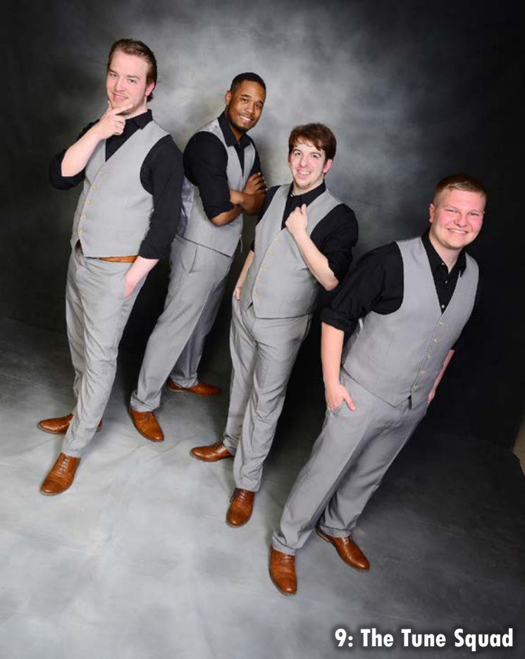
9: The Tune Squad