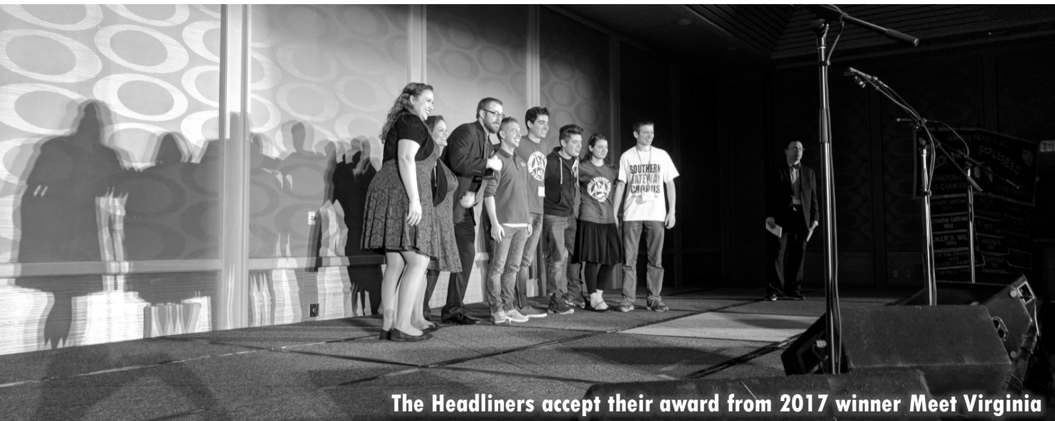
The Headliners accept their award from 2017 winner Meet Virginia