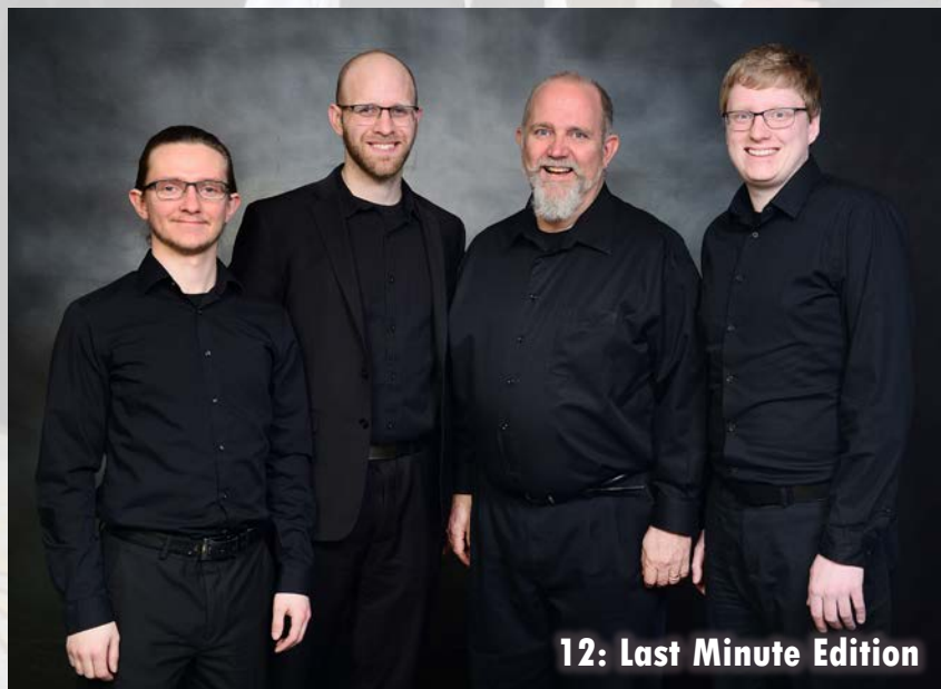
12: Last Minute Edition