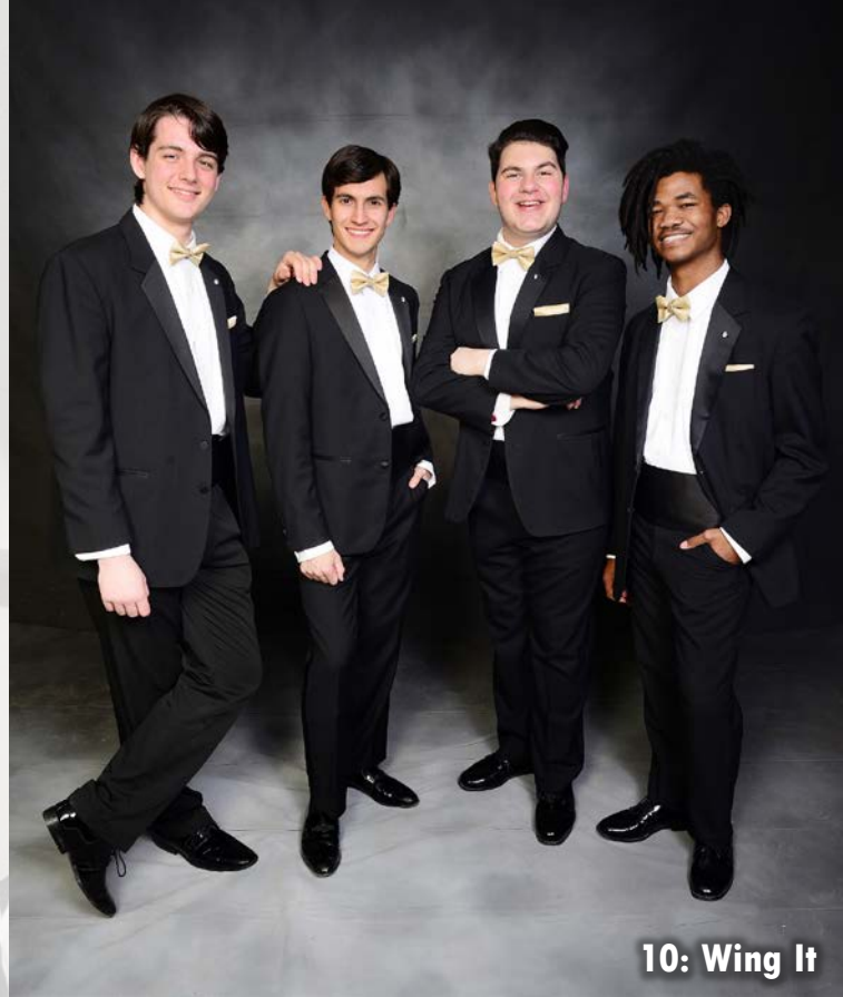
10: Wing It