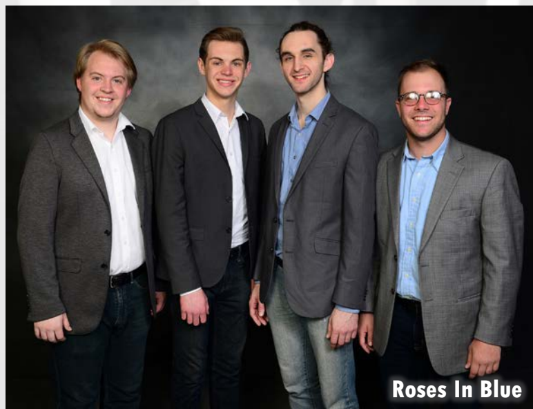
Roses In Blue