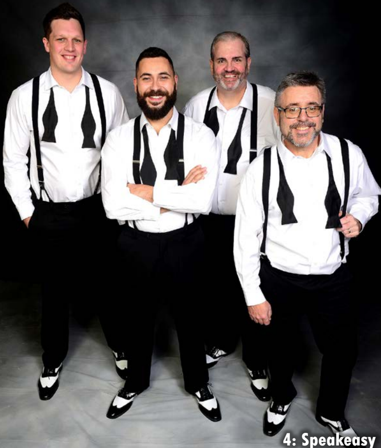
4: Speakeasy International Qualifier